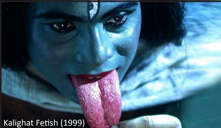
Kalighat Fetish (1999)