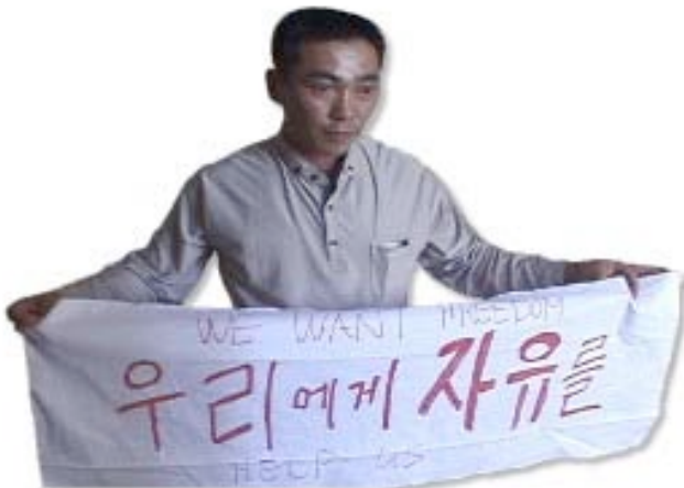
A North Korean refugee, part of a group known as the "MoFA Seven," holds up a banner that reads "We Want Freedom. Help Us." The MoFA Seven attempted to apply for asylum to the Chinese Ministry of Foreign Affairs (MoFA).