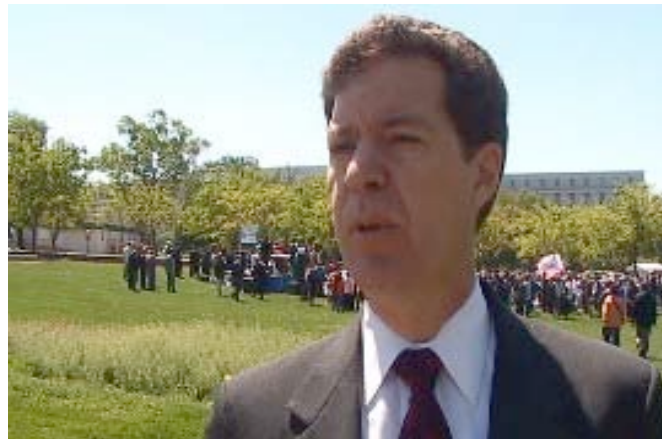
Senator Sam Brownback (R-KS), former member of the Senate Foreign Relations Committee and sponsor of the legislation that became the North Korean Human Rights Act of 2004 (HR-4011), champions the rights of North Korean refugees on Capitol Hill.