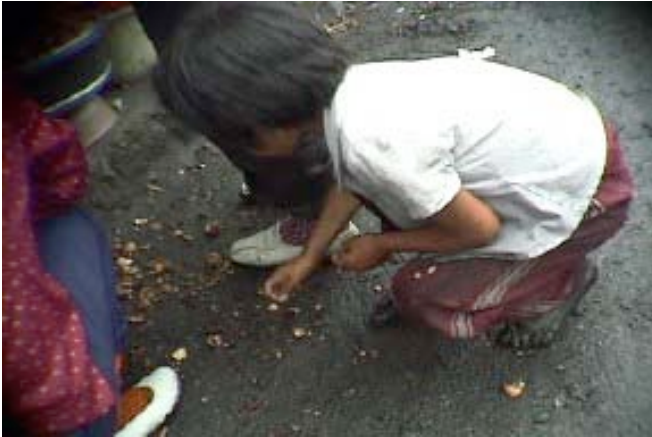
North Korean children scrounge for food as a result of a devastating food crisis that has killed an estimated 3 million North Koreans in the past 10 years.