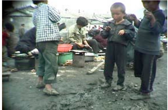
North Korean children scrounge for food as a result of a devastating food crisis that has killed an estimated 3 million North Koreans in the past 10 years.