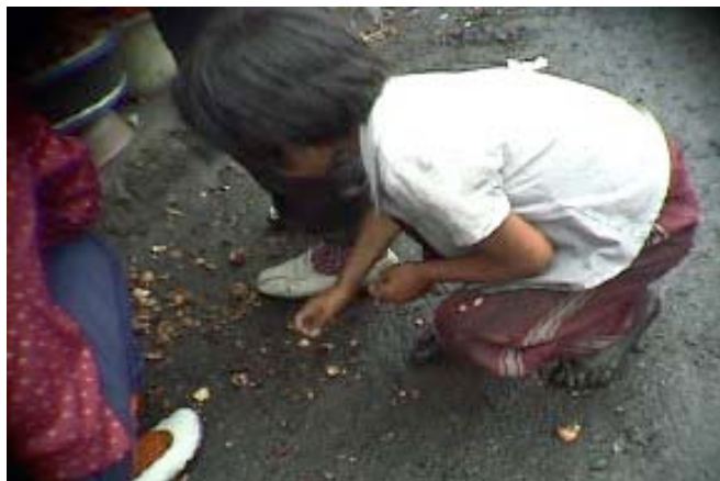
North Korean children scrounge for food as a result of a devastating food crisis that has killed an estimated 3 million North Koreans in the past 10 years.