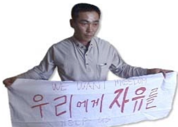
A North Korean refugee, part of a group known as the "MoFA Seven," holds up a banner that reads "We Want Freedom. Help Us." The MoFA Seven attempted to apply for asylum to the Chinese Ministry of Foreign Affairs (MoFA).