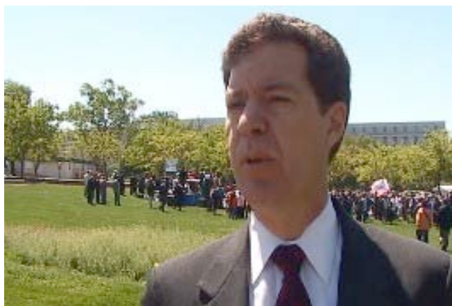
Senator Sam Brownback (R-KS), former member of the Senate Foreign Relations Committee and sponsor of the legislation that became the North Korean Human Rights Act of 2004 (HR-4011), champions the rights of North Korean refugees on Capitol Hill.