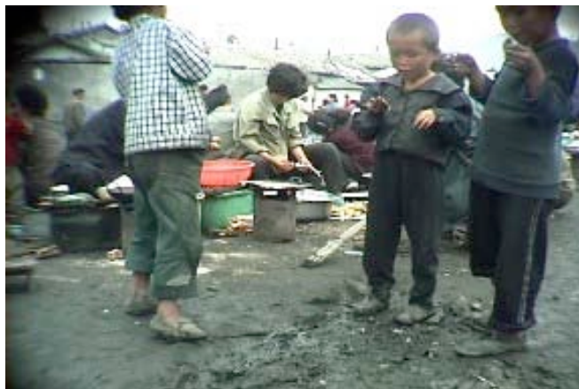
North Korean children scrounge for food as a result of a devastating food crisis that has killed an estimated 3 million North Koreans in the past 10 years.